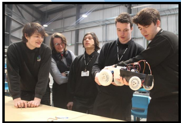
Year 13 engineering students have been developing their prototypes for their remote control cars.