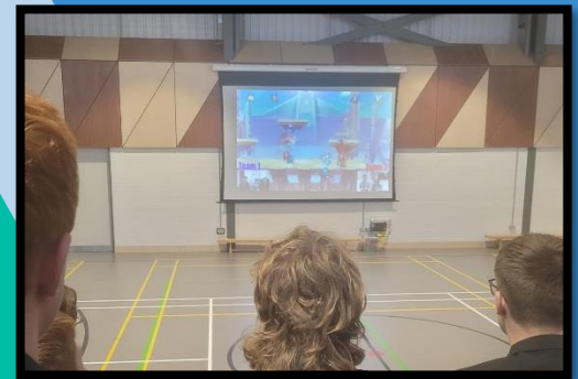
The Esports final took place in front of a packed challenge arena.