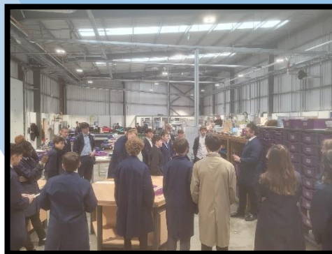
Year 10 engineers have been developing their practical skills in the barn.